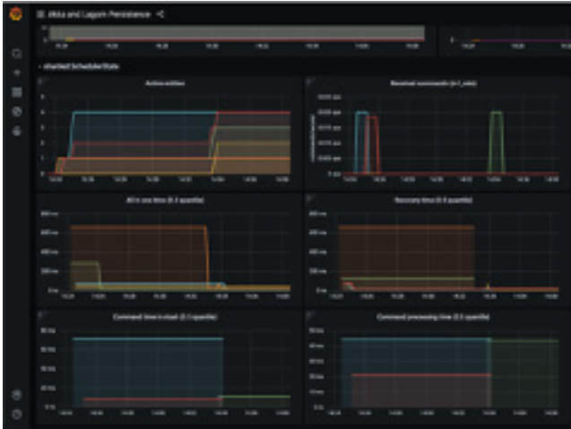
Pre-Built Grafana Dashboard - Akka Persistence Metrics